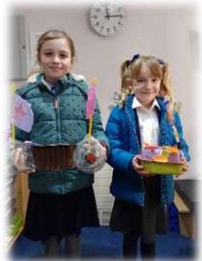
The winning designs!

A great time spent together sharing stories