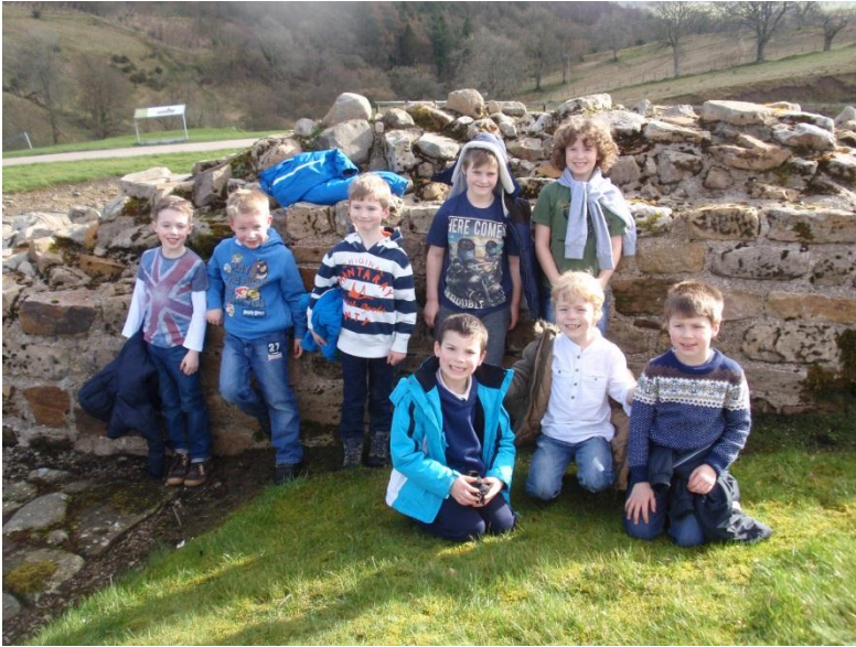
All these boys are all together. (Year three and year two boys.)